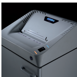
LED INDICATORS Easy to operate ON OFF Reverse switch, with LED signal for bag full or open door

SUPER POTENTIAL POWER UNIT heavy duty chain drive system with metal gears CONTINUOUS DUTY 24 hours continuous duty operation without overheating and duty cycles CUTTING KNIVES carbon hardened steel cutting knives unaffected by staples and clips ENERGY SMART ® power saving stand-by mode START & STOP automatic start and stop through electronic eyes with stand-by function SAFETY STOP automatic stop with light signal for bag full and / or open door AUTOMATIC REVERSE system in case of jamming CABINET attractive 60 litre cabinet mounted on casters