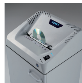
AUTO START & CD SHREDDING Automatic Start/Stop through electronic eyes. Integrated flap for CDs, DVDs and Credit Cards shredding