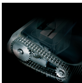
CHAIN heavy duty chain drive system and metal gears