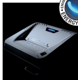
ENERGY SMART ® management system with illuminated indicators for power saving in stand-by mode