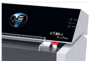
REMARKABLE TOUCH SCREEN PANEL