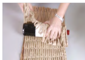
FILLING MATERIAL FROM CORRUGATED CARDBOARD for safe deliveries of any product.