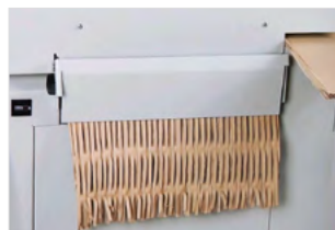
ADJUSTABLE CUSHIONING VOLUME OF HARD CARTON