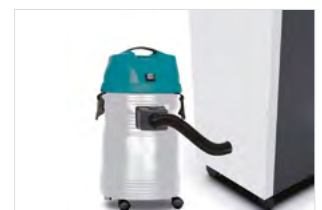
DCS-500 COMPLETE DUST COLLECTION SYSTEM to provide dust free padding mats.